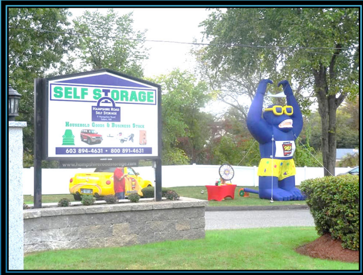
Hampshire Road Self Storage Salem, NH