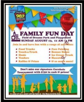
Serving our community