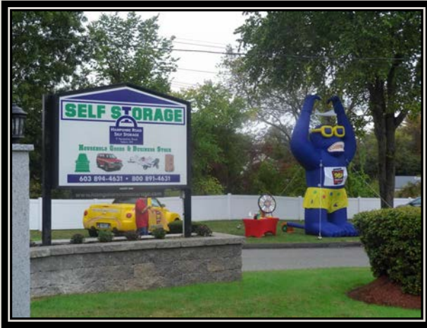
Hampshire Road Self Storage Salem, NH